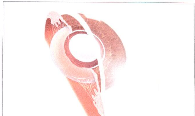
The IOL implant permanently replaces the natural lens.