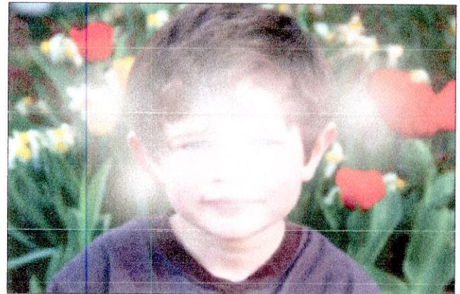
Blurring or dimming of vision