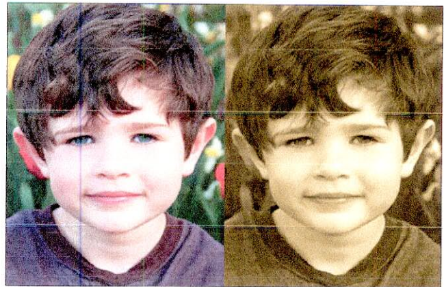
Left, normal vision. At right, dulled or yellowed vision.