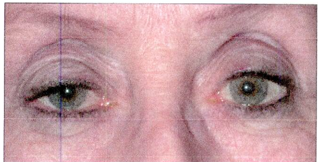
Ptosis in an adult

Adult ptosis may also occur as a complication of other diseases involving the levator muscle or its nerve supply, such as neurologic and muscular diseases and, in rare cases, orbital tumors.