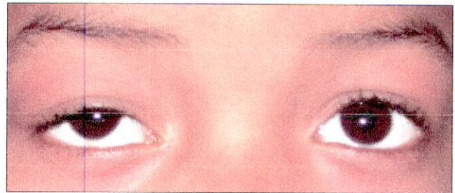
Child with ptosis of right lid

Congenital ptosis usually does not improve with time.