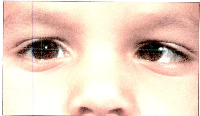
Strabismus. Notice the asymmetric light reflection.

When one eye is out of alignment, two different pictures are sent to the brain. In a young child, the brain learns to ignore the image of the misaligned eye and sees only the image from the straight or better-seeing eye. The child then loses depth perception.